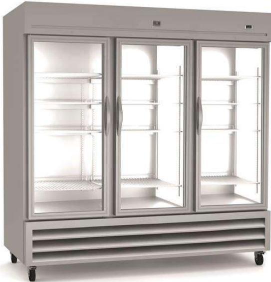
738315 (KCHRI81R3GDR) 3-Glass Door Full Height Refrigerator 81" Long